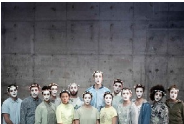
Unga Klara, "X".